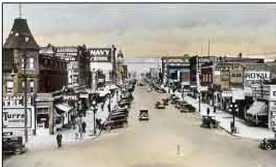
Main Street in Moose Jaw